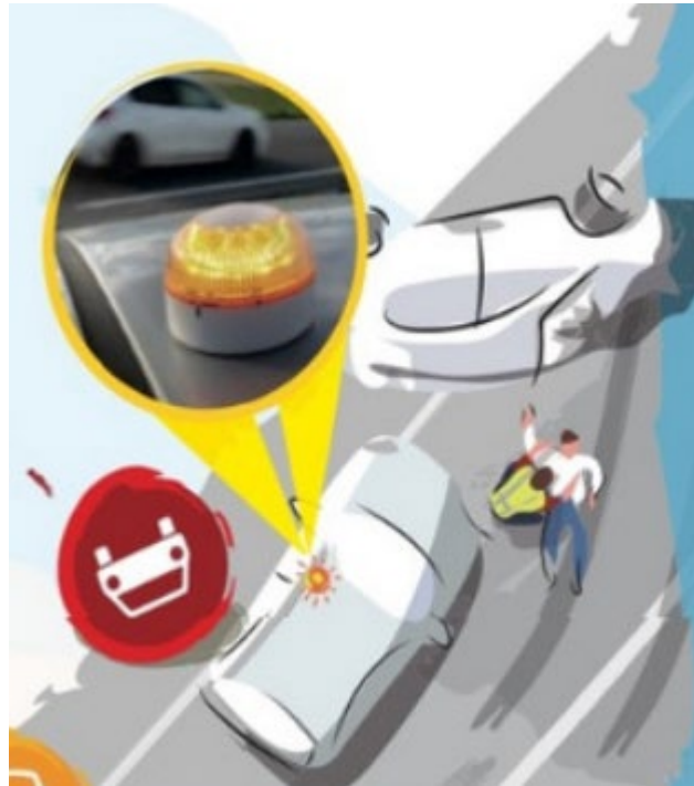
Illustration 1. V-16 signal.

The new V-16 signal is an orange flashing light that replaces triangles as a means of signalling a stationary vehicle on the road. It must be placed as high as possible on the vehicle when it is immobilised on the road in order to ensure maximum visibility and must communicate its geolocation with the DGT 3.0 platform in order to alert other drivers approaching that point of the road.